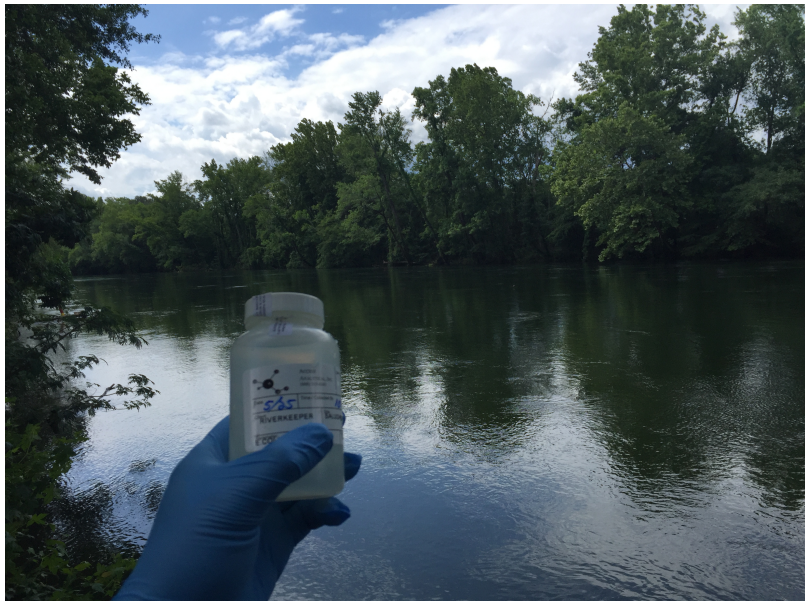
Collecting a Water Quality Sample at Saluda Shoals Park

WLTX - More Water Quality Tests For Popular Rivers