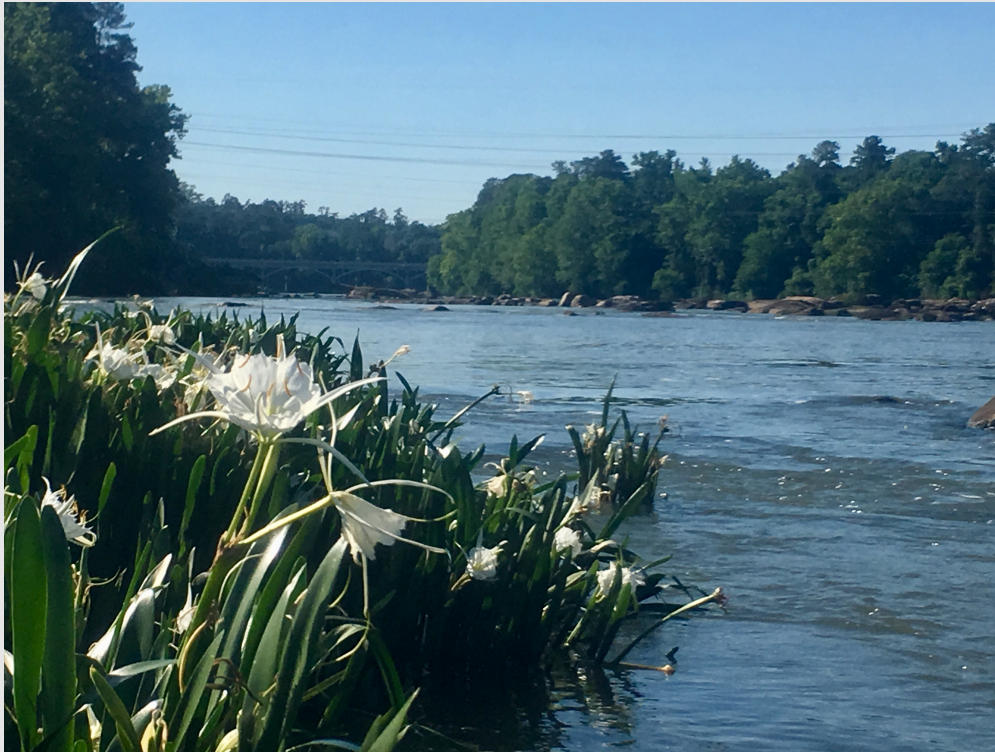
Rocky Shoals Spider Lilies on the Broad River

Congaree Riverkeeper works to protect and improve water quality, wildlife habitat, and recreation on the Congaree, Lower Saluda and Lower Broad Rivers through advocacy, education and enforcement of environmental laws.